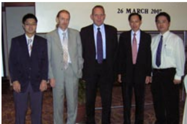
AICLA President & International Development Director's visit to Malaysia

Promotion of AICLA was also made to young loss adjusters of one of the major loss adjusting firms which generated interest in the AICLA study course and membership.