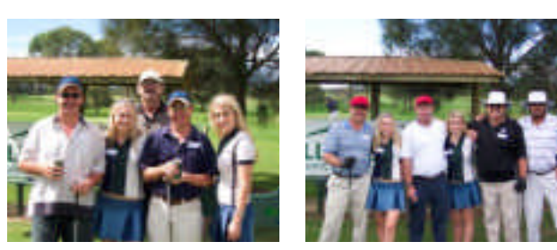
Some members enjoying the AICLA Charity Golf Day

A successful AICLA Charity Golf Day was held on 7 April 2003 at Nudgee Golf Course. Great weather, good course and a mix of loss adjusters, insurers, service providers and sponsors were ingredients for a great day. Thanks to the generous support of sponsors; Alliance Construction, Australian Building Services, Munters, Rocket Group, Central Building Services, Gray Eisdell Martin, Harvey Norman, O'Brien Glass, Patrick's Jewellers and Queensland All Trades, a donation of $2,000 was made to the Royal Childrens' Hospital Foundation. Also attendees received an AICLA promotional umbrella "Chartered Loss Adjusters – Claims Professionals" .